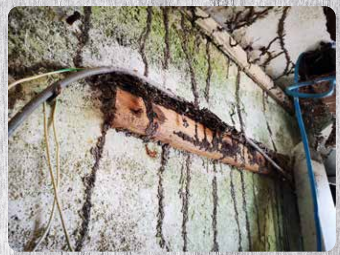
Mud channels built by Reticulitermes flavines to reach feeding areas.